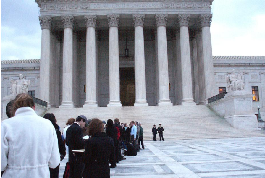
Early January 9, 2008 citizens waiting to enter the U. S. Supreme Court.