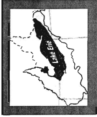
The Lake Erie Basin has a U.S. geographic area of 20,900 square miles.

Position on Concentrated Animal Feeding Operations 2007